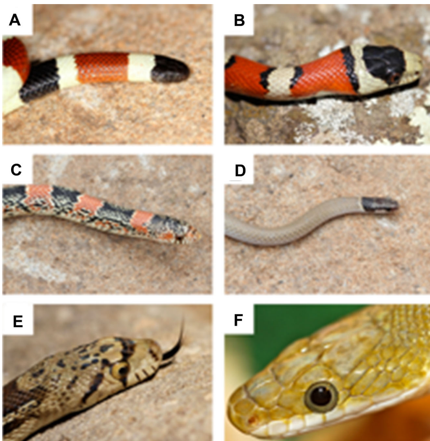
Fig. 1. Representative taxa sampled for pigment analysis. (A) Arizona coral snake, Micruroides euryxanthus . (B) Arizona mountain kingsnake, Lampropeltis pyromelana . (C) Long-nosed snake, Rhinocelchus lecontei . (D) Yaqui black-headed snake, Tantilla yaqui . (E) Gopher snake, Pituophis catenifer . (F) Green rat snake, Senticolis triaspis .

Reptiles and amphibians (including snakes) produce colors by selectively reflecting or absorbing certain wavelengths of light with specialized cells called chromatophores (reviewed in Cooper and Greenberg 1992; Olsson et al. 2013). There are three principle kinds of chromatophores: erythrophores, iridophores, and melanophores. Erythrophores (sometimes